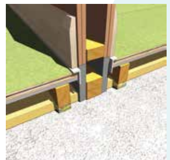
Internal Wall Junction Loadbearing (Rip Liner alternative detail)