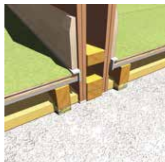
Internal Wall Junction (Loadbearing)